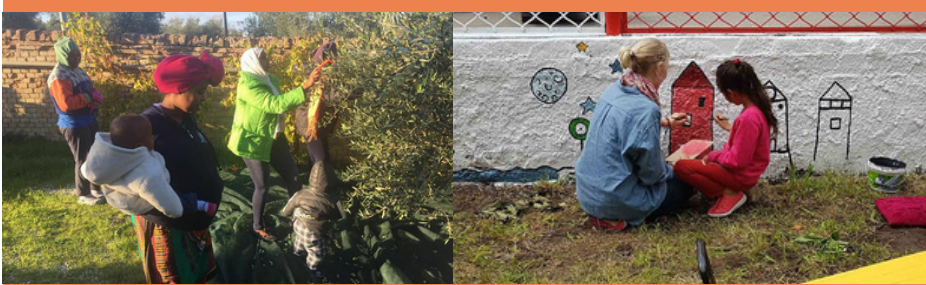
Outdoor activities and creative workshops with the children