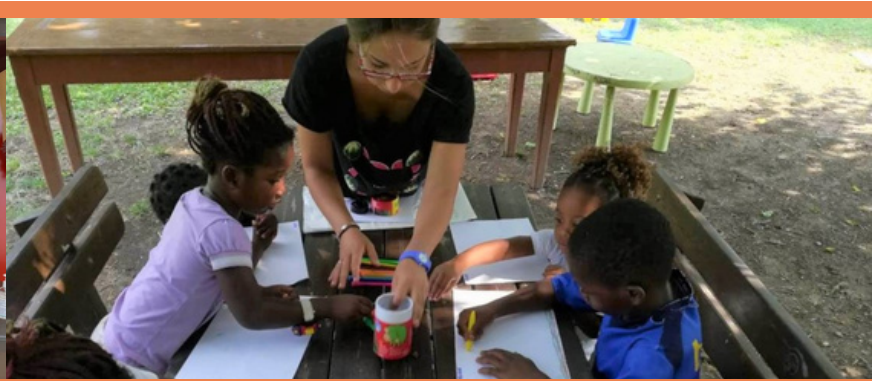
Activities with the children