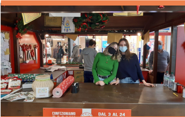
Support during events